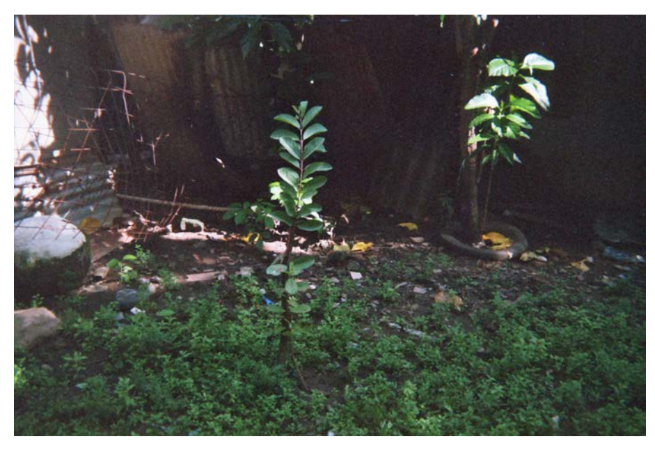
A Guayaba tree in the back garden.