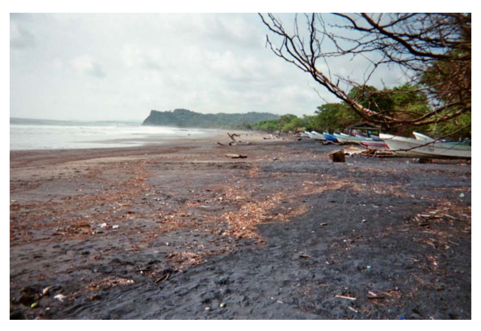
All the Pangas line the shore of El Astillero's beach.