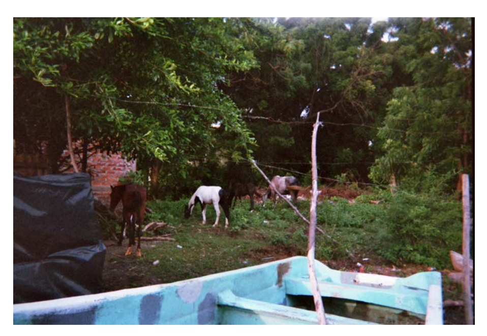
A Panga undergoing repairs rests amongst the horses.